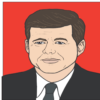
Sample of Photo Layout